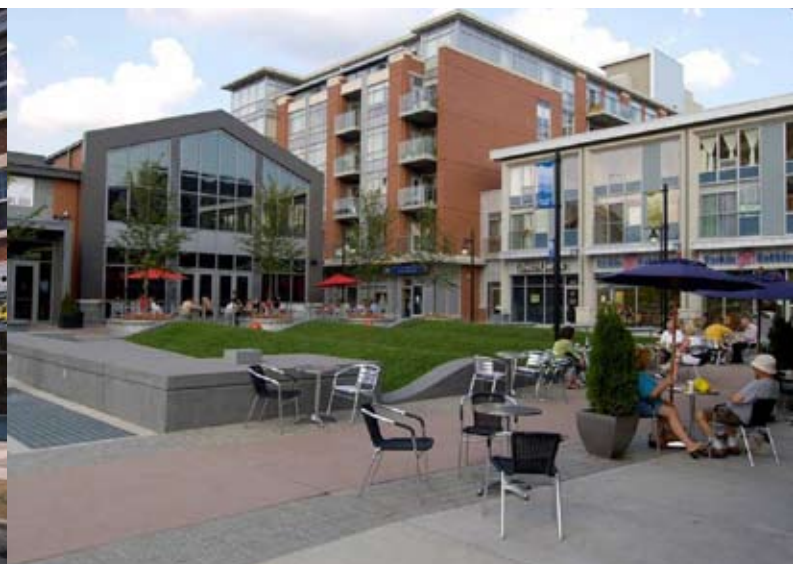
Garrison Woods, Calgary and Port Credit Village, Mississauga