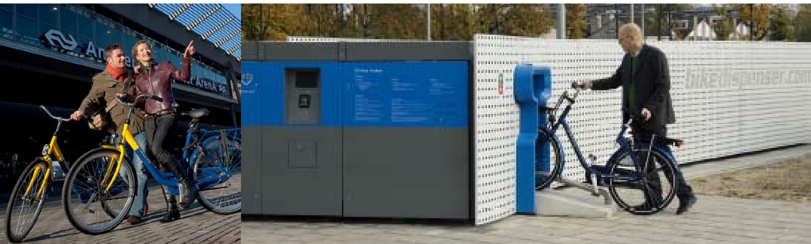
OV-Fiets bikes and Bike Dispenser