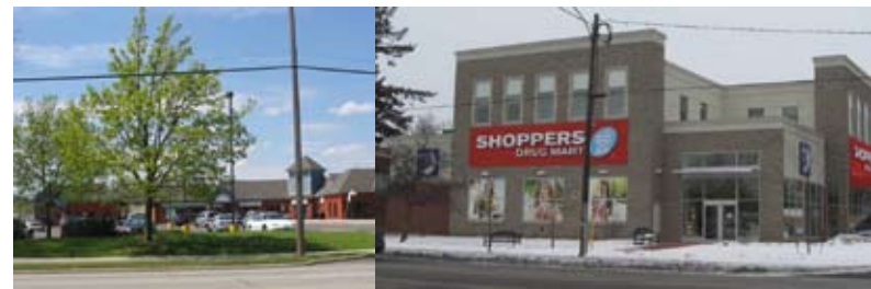
Car-oriented versus pedestrian-oriented retail development in Burlington, Ontario

As planners and politicians are realizing the errors in our past ways, there are different approaches to improving options for walking and cycling, based on the urban versus suburban context. One of the biggest challenges in the coming decades will be to retrofit the suburbs for a way of life that does not always necessitate car use. The advantage in suburban areas is that wider streets provide more space to make complete street improvements.