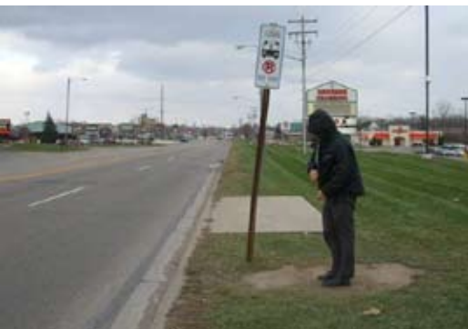
Incomplete Streets