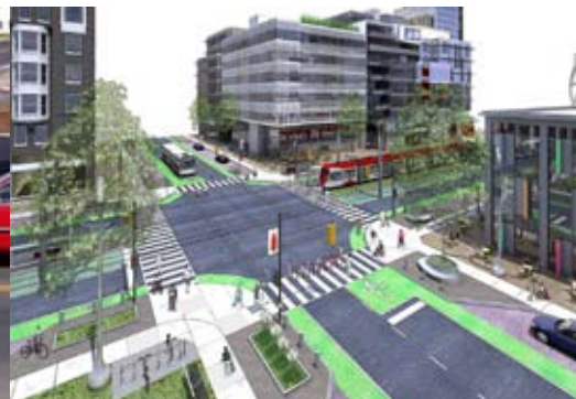
A Complete Street design concept, photo courtesy Chris Hardwicke

"There is no 'war on the car'. It's just about revitalizing [streets]."