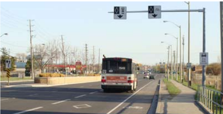
Dufferin Street, York Region

Planners and urban designers should not assume that more typical suburban land uses, like car mechanics, gas stations, and big box stores, need to disappear – instead they just need to be rethought to fit in with an urban form that supports all modes of transportation. For example, the abundance of franchise outlets can be accommodated in building designs that are close to the street, with entrances fronting the street, and floor space spread out on two levels (with less floor space per level) rather than just on one level (with a greater floor space). Design and construction efforts such as these require coordination and cooperation between public and private sector interests.