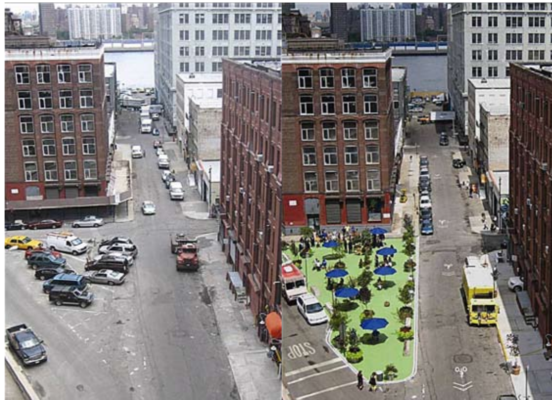
New York City's Complete Streets conversions

370,000 pedestrians pass through Times Square area each day, yet for years pedestrian space only accounted for 11% of the area. With the conversion, the space is now safer and more inviting for pedestrians - somewhere to stay and enjoy rather than escaping as quickly as possible. In order to implement this plan, and other major Complete Streets project around New York City, the Department of Transportation has positioned their proposals as improvements to safety and efficient travel, avoiding the marginalized or unquantifiable arguments for public space, economic development and livability. This approach has so far won the necessary support for these types of projects. The more potentially controversial projects are proposed first as pilot projects, and only made permanent after extensive evaluation determines that the pilot period was successful. Since the implementation Times Square project travel times have improved and injuries have fallen 63%, with fewer pedestrians forced to walk on the street. On 9th Avenue, which has a separate bike path, crashes of all kinds have fallen by 56%, while bike volumes along the corridor have risen by 50%. In total, 200 miles (322 km) of bike routes were built between 2006 and 2009.