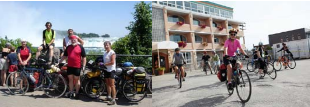
Bicycle tourists in Niagara, photos courtesy Louisa Mursell and Ken Forgeron

In Canada, bicycle and walking tourism are typically a highly undervalued aspect of active transportation. Active transportation proponents need to put some of their focus on tourism as economic development projects that will have a long-term sustainable effect, especially in communities experiencing economic decline and job loss. Many of today's tourists want healthy, interactive, and authentic experiences, so this is strong potential market for walking and cycling holidays.