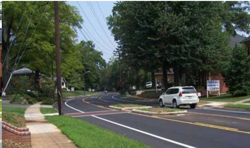
Before-and-After: East Boulevard, Charlotte, NC